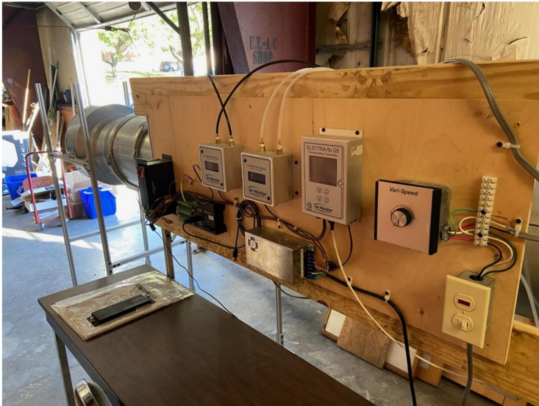
Figure 1 : AITF wind tunnel north view showing instrumentation board , cabling, work table, and flow exhaust to UT Drive Services Building B outdoor exit.